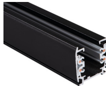
33233 TEAR N TR 2M-B

Track system component, TEAR N TR 2M-B, 3-circuit track, black, (33233)