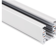
33230 TEAR N TR 1M-W

Track system component, TEAR N TR 1M-W, 3-circuit track, white, (33230)